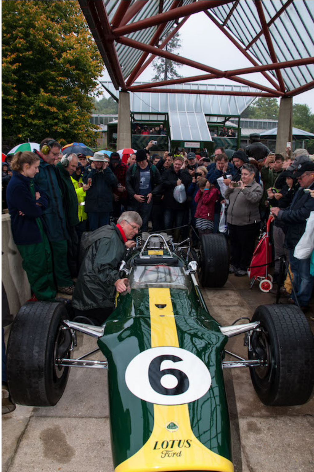
Starting up the Lotus 49.