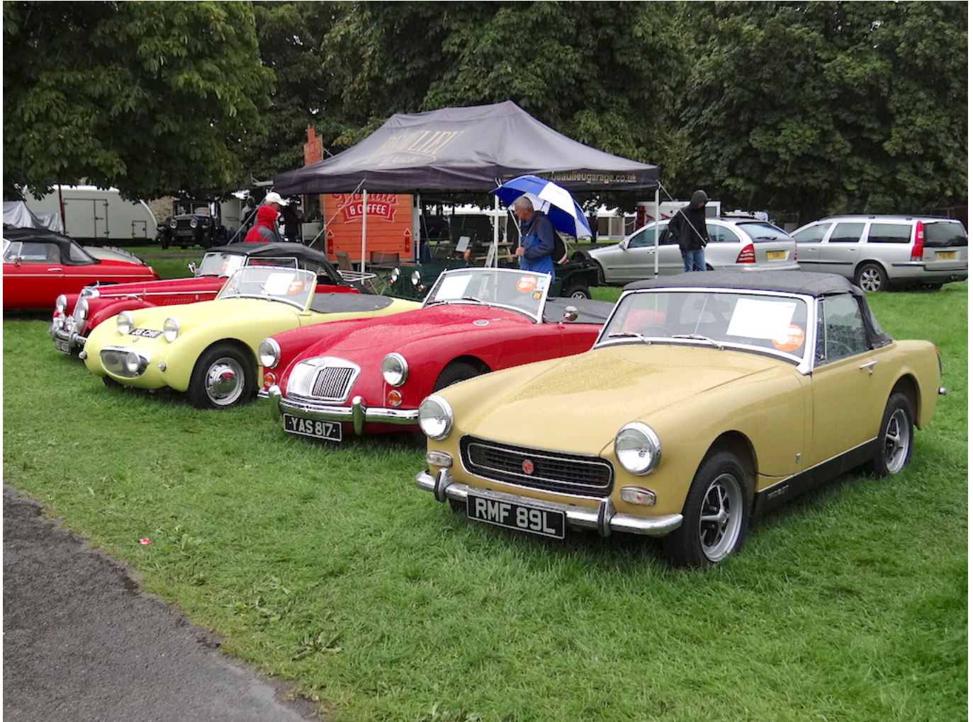
Three classic BMC sports cars on sale in the Dealmart area.

On the Sunday (only) there was the additional 'Trunk Traders' section, enabling enthusiasts to sell components from the 'boots' of their cars.