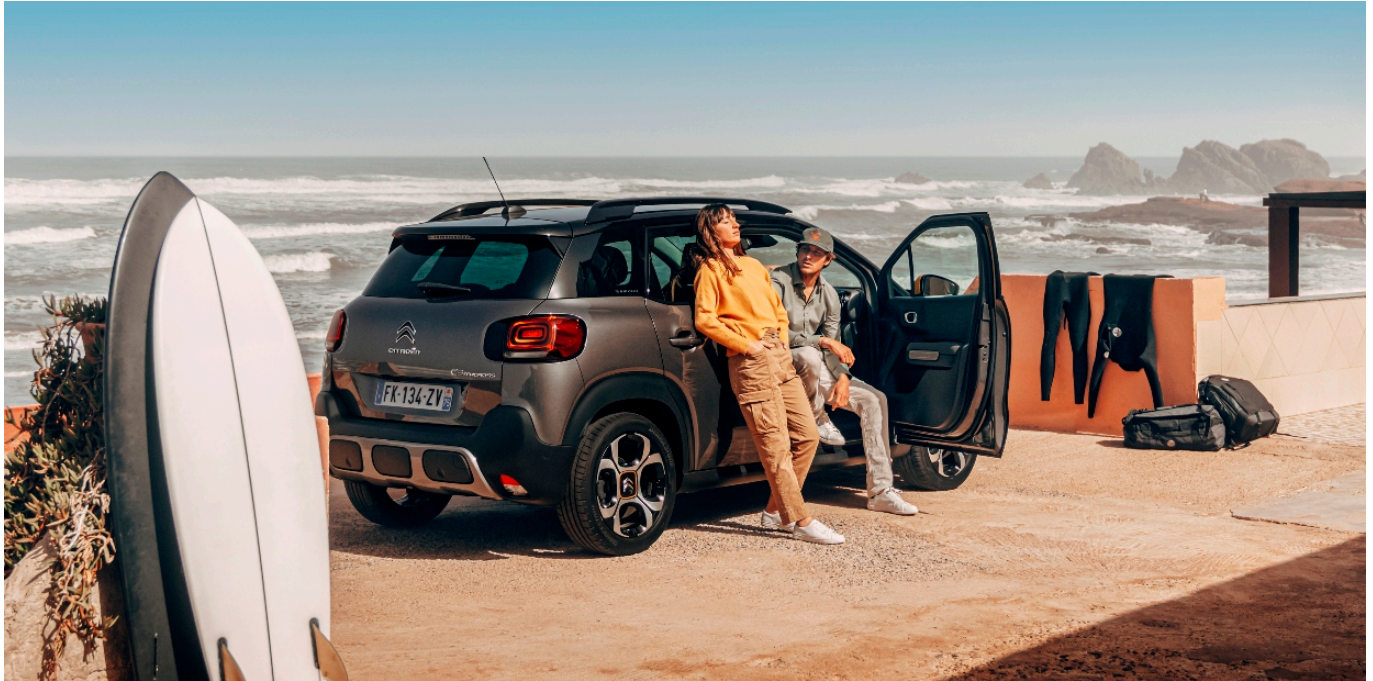
Surf's up!

It is equipped with the award winning PSA Group's 1.2 litre, three cylinder PureTech 110 hp petrol engine with Stop&Start and with a six speed manual powertrain. It has numerous standard items of equipment to make life 'an absolute breeze' These includes Citroën Connect Nav, a 7-inch touch-sensitive tablet, Mirror Screen functionality, Citroën Connect Box and automatic climate control.