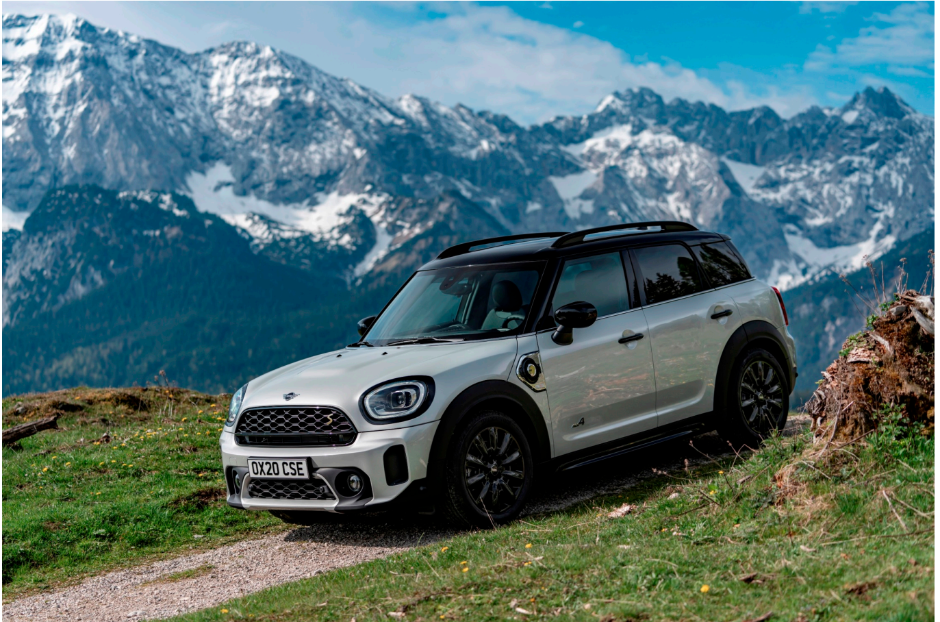
MINI's updated Countryman range including the ALL4 PHEV model.