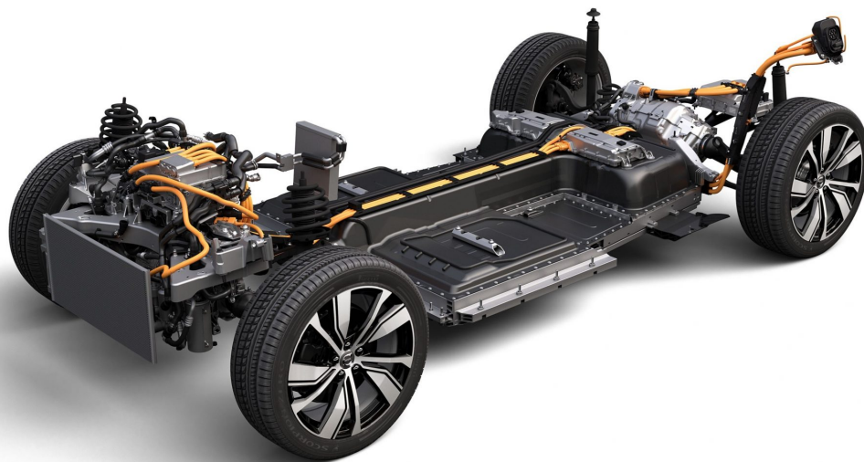
Volvo's XC40 SUV Recharge all-electric powertrain.

Meanwhile Volvo has announced their order books are open for their first all-electric model – the XC40 Recharge Pure Electric compact SUV. Priced from £53,155 you can order now but must wait until early 2021 for delivery.