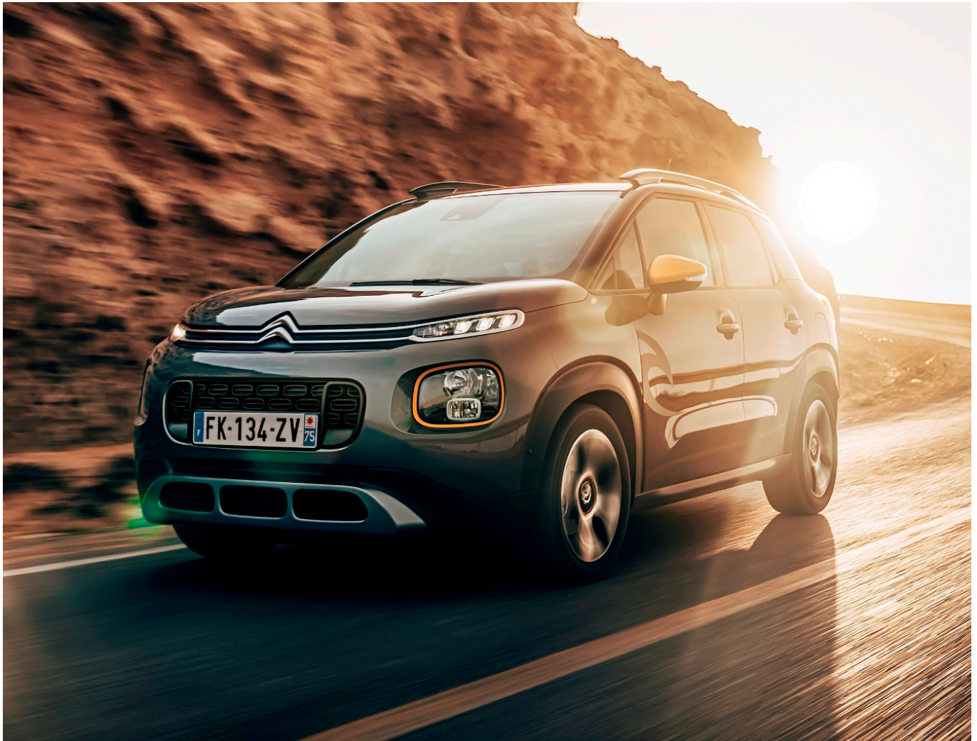
C3 Aircross Rip Curl compact SUV in action.

With its quirky character the C3 Aircross compact SUV has become a significant player in its sector having won over nearly 290,000 customers in Europe. In time for summer the new C3 Aircross Rip Curl special edition is based on the Flair trim level with enhanced lifestyle specific features both inside and out.