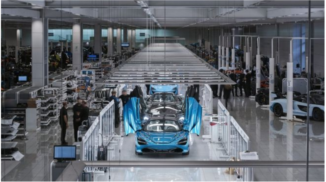
Job losses for McLaren's production line.

Despite that doom and gloom unemployment forecast, trade pundits are still forecasting a boom in new and used car sales once dealerships are open as pent-up demand is predicted.