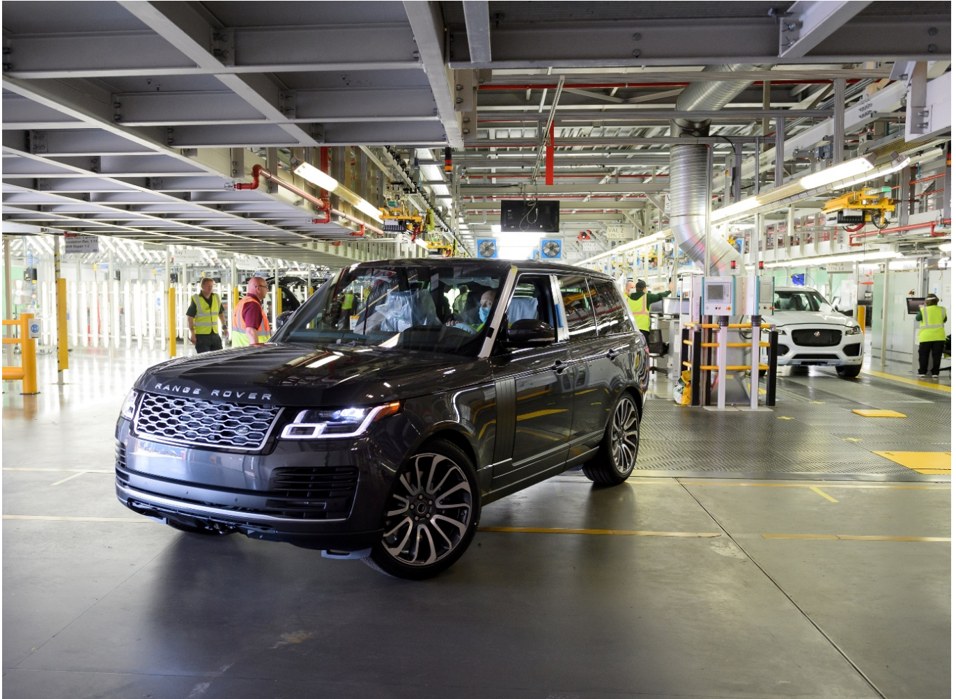
The first Range Rover produced under social distancing measures rolls off the production line.

Other manufacturers are in similar positions. Renault has asked the French Government for financial support so has Fiat in Italy whilst Nissan is reviewing their European manufacturing structure with job losses expected. Hopefully these will not be in the UK with rumours that Nissan's Renault partnership could see Renault Captur and Kadjar SUVs being built on the same Sunderland production lines as the Juke and Qashqai in this country as they share the same modular platforms.