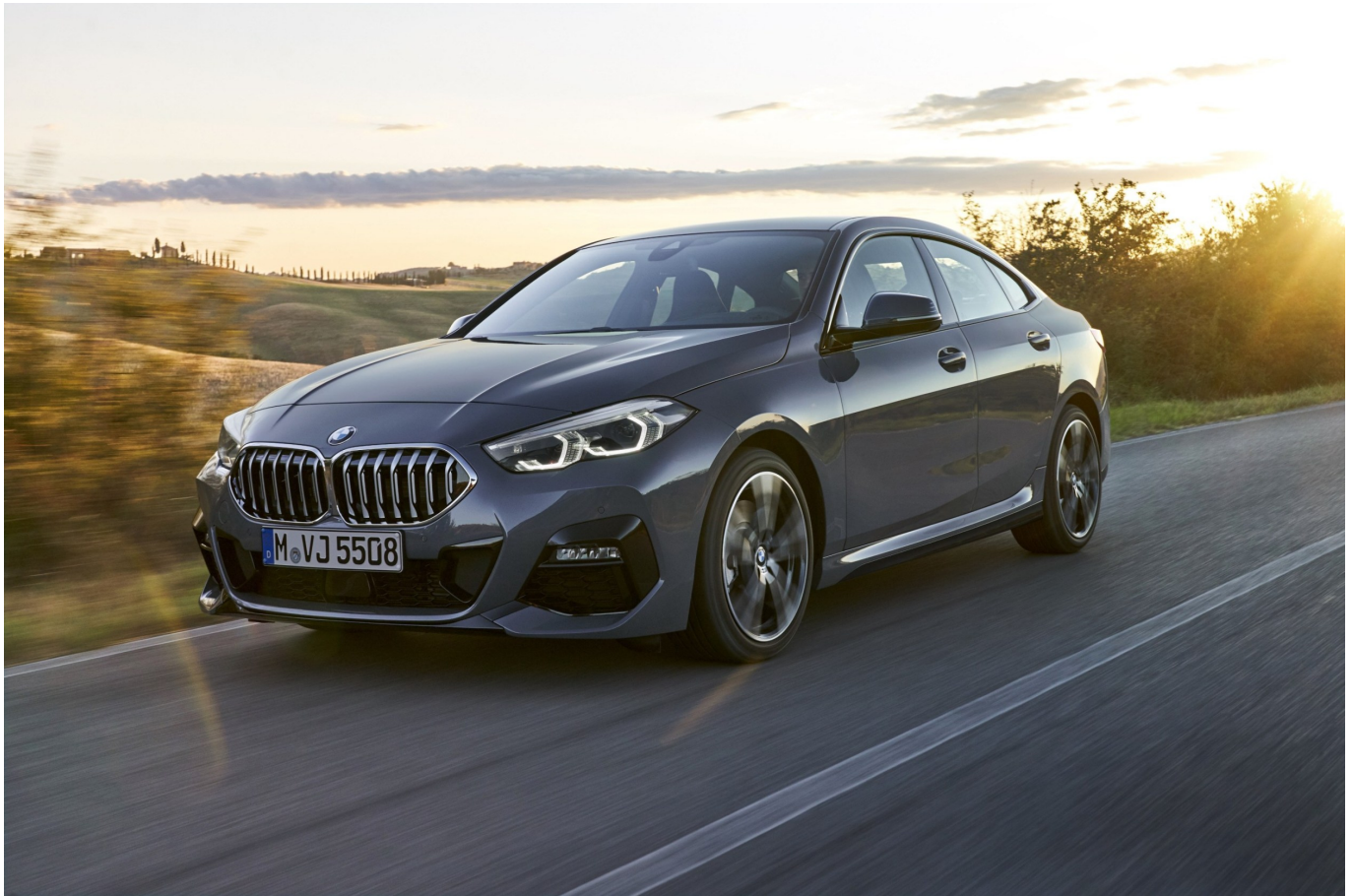
BMW's 2 Series Gran Coupé now with a 190 hp 220d engine.

For good measure more BMW emailed press releases this week announced the production of a new X2 SUV model – the xDrive 2.5e plug-in hybrid and also a revised 5 Series line-up was announced. Saloon and Touring models start arriving in July with more later this year. And yes we got 5 Series prices, Saloons £37,480 to £67,595, Touring models £39,730 to £57,485 but there are some TBC gaps for 'e' PHEV versions to be filled in yet.