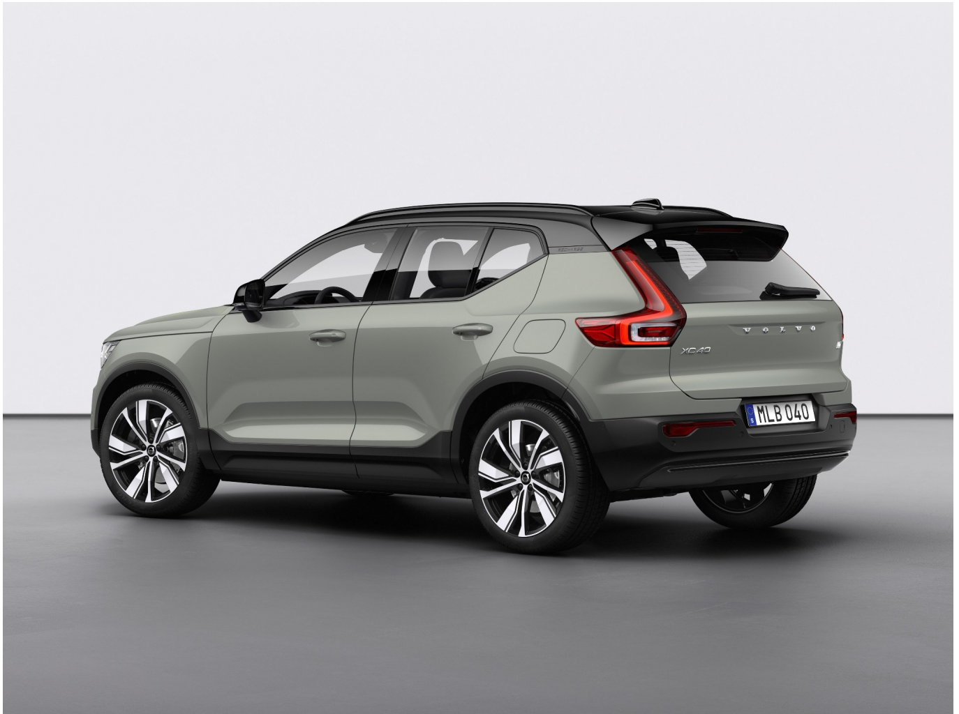
New Volvo XC40 Recharge all-electric SUV.

This model is capable of being driven for more than 249 miles on a single charge and fast charging gives 80% of capacity in 40 minutes. Using two electric motors producing a total of 408 hp it takes just 4.9 seconds to accelerate from zero to 62mph.