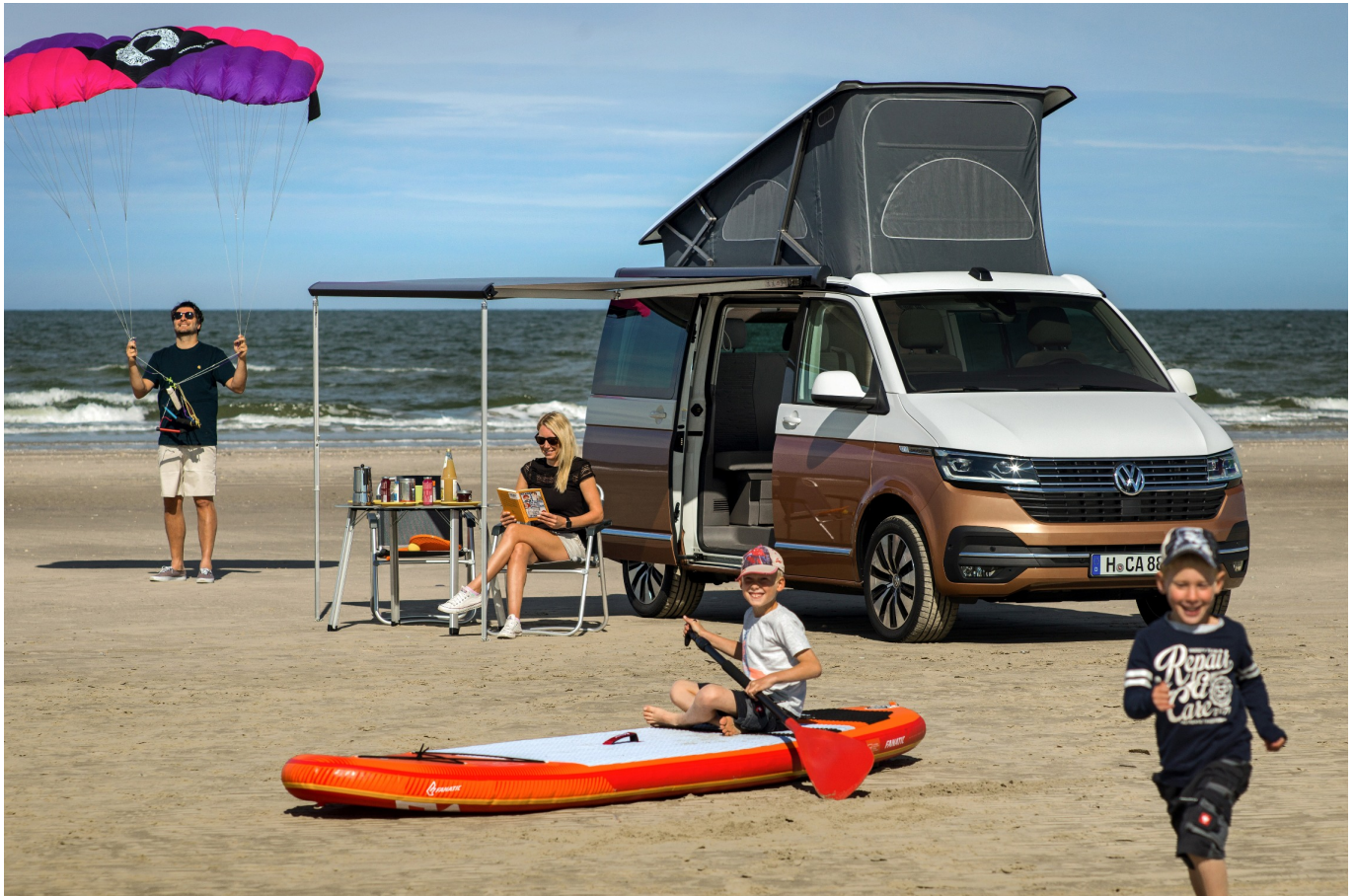
VW's UK family holiday answer, the California camper.

You might be a bit short on space inside a camper style vehicle but these days there is no shortage of equipment and extra cost options. More or less everything including the kitchen sink can be included. Items such as solar panels, TVs, air conditioning, fridges, elevating roofs, overhead beds, rear bicycle rack and much more are available.