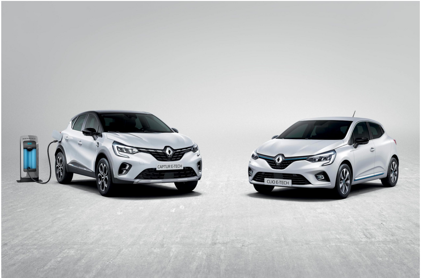
New Renault Captur PHEV and Clio Hybrid models.

The Captur PHEV uses a 1.6 litre petrol engine with two electric motors with a power output of 160 hp and a clutchless auto transmission, providing up to 30 miles of all-electric power with CO2 emissions of 33 g/km and 188.3 mpg. The Benefit-in-Kind company car tax rate is 10%.