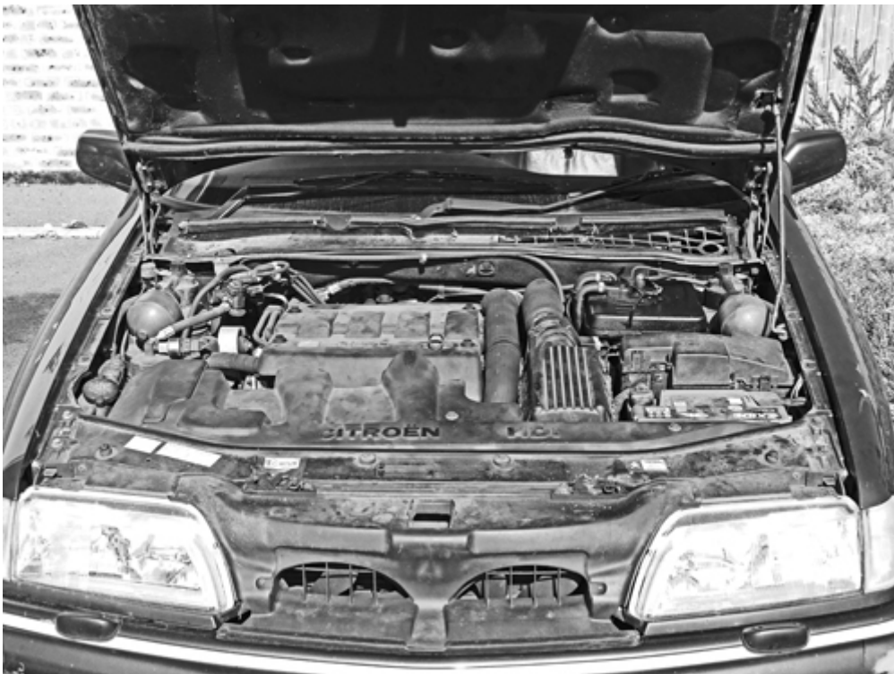
General view of the Xantia's engine bay.

Morning dawned and, fortified with toast and tea, I went out into the unhelpful wind and attempted to commune with the engine. It had made a noise a bit like a tube or a bottle becoming blocked, so I took off the cover to the air filter expecting an old clogged thing to emerge. The filter was pretty clean, but the box around it contained a number of leaves. I collected them up and returned them to nature, replaced the filter and tried the engine again. A worrying and unfamiliar yellow light had come on. For the first time ever, my owner's manual was not in the car to identify it from, so I continued with my first thought and chucked out the air filter.