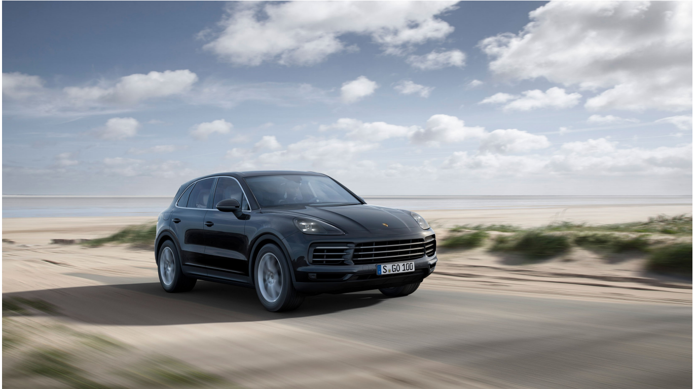
New Cayenne