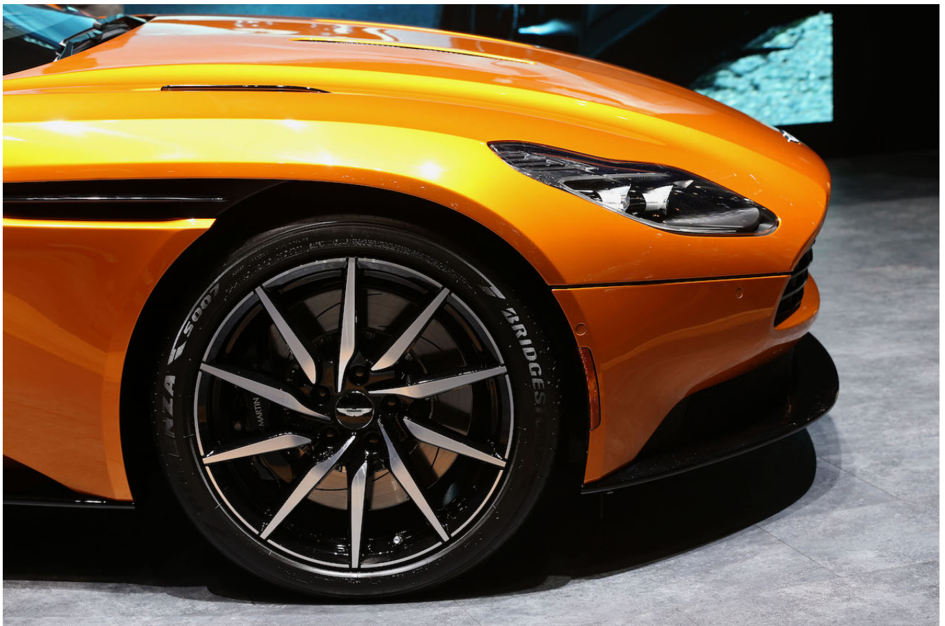
Bridgestone. Geneva Motor Show 2016