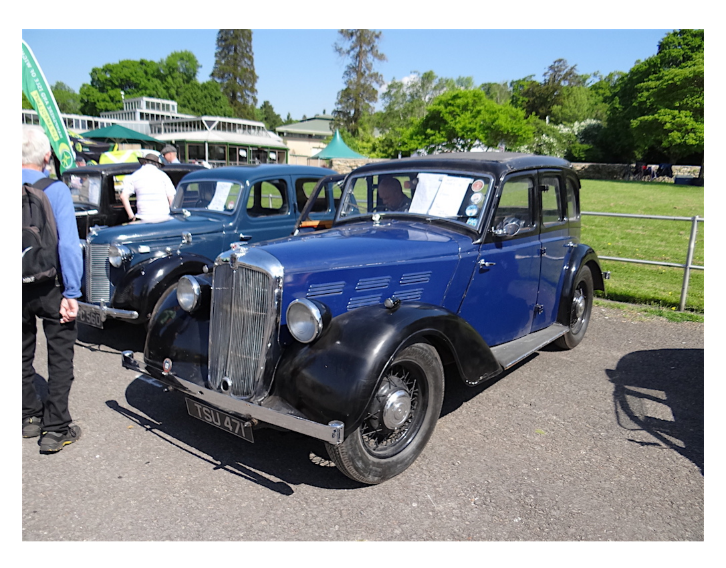
Moggyfest and friends