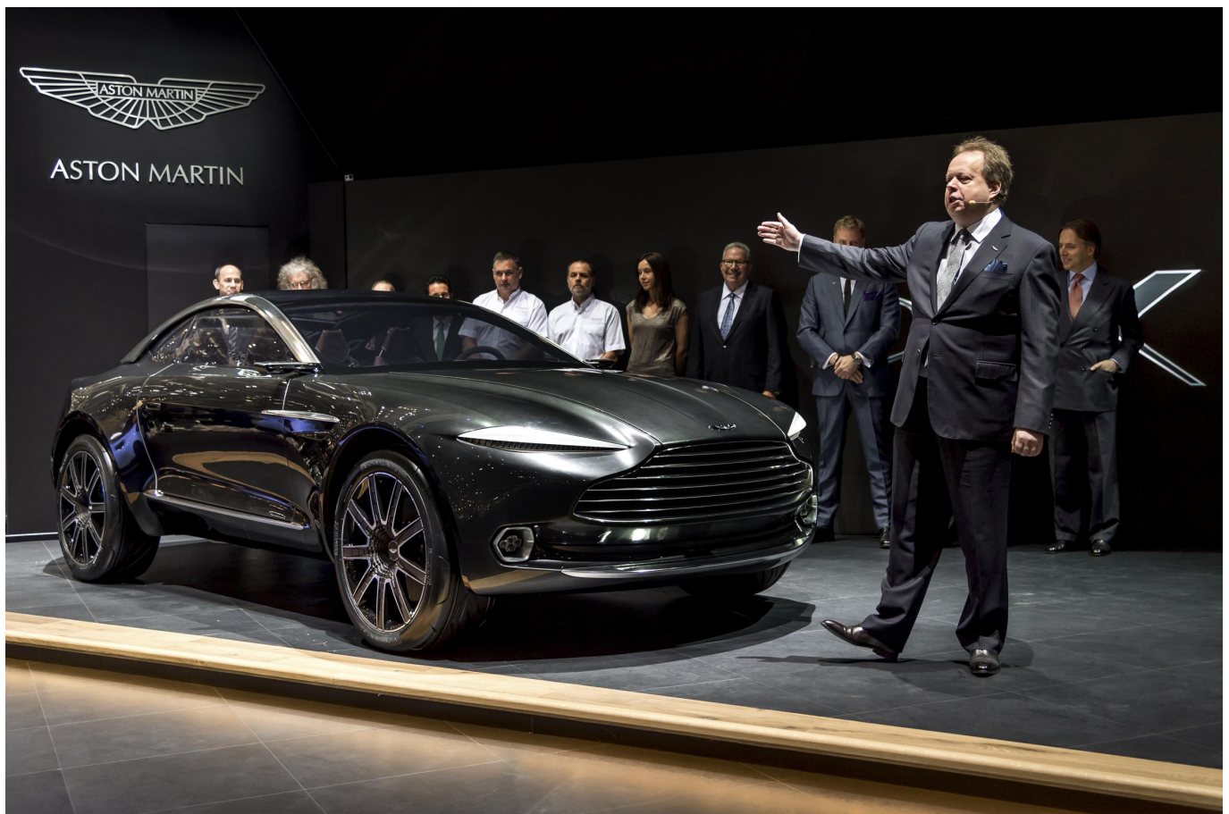
Aston Martin DBX Concept being unveiled at the 2015 Geneva Motor Show...

Online version: https://www.wheels-alive.co.uk/aston-martins-new-model-to-be-built-in-wales/